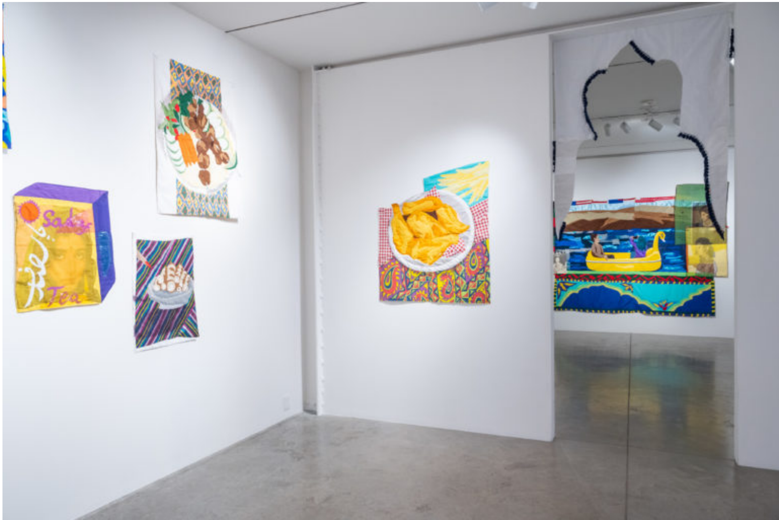
Installation view of Hanagama Amiri's "Wandering Amidst the Colors," photo by Casey Kelbaugh, courtesy of the artist and Albertz Benda.

WW: These textile and mixed media works are large in scale and greatly detailed. Can you give us a look at your process?