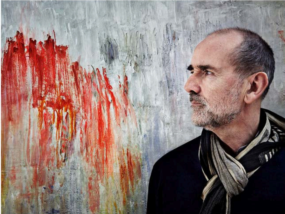
Portrait of Christopher LeBrun.

11 Sep–15 Oct 2014 at Friedman Benda Gallery, New York