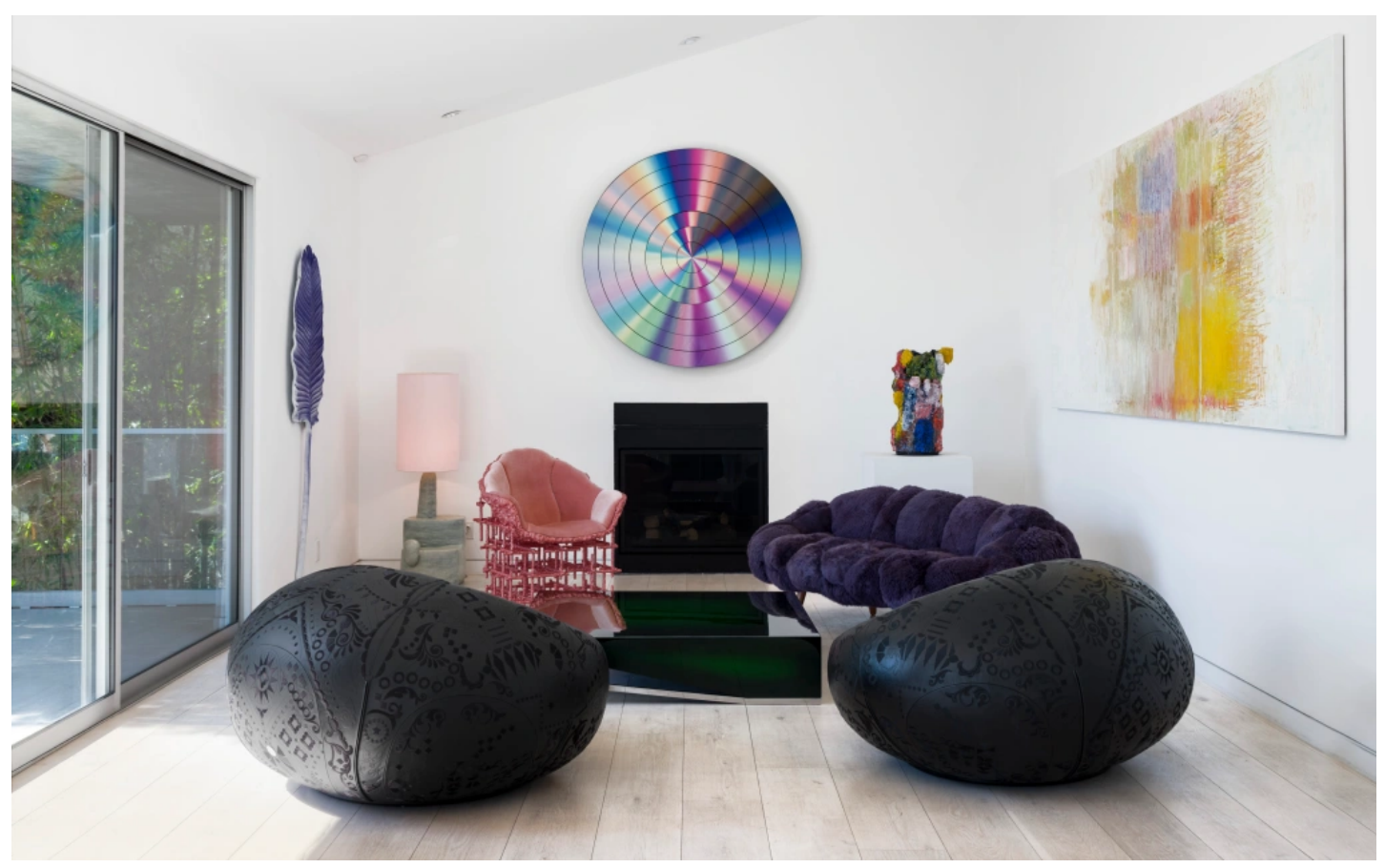
The Endless Summer exhibit at albertz benda / Friedman Benda, Los Angeles. Through March 26. Courtesy of the artists and albertz benda and Friedman Benda, New York.