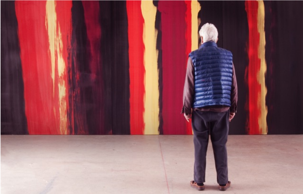
Ed Moses.

This Saturday, April 9, legendary West Coast artist Ed Moses turns 90 years old. His illustrious career as an abstract painter started with a group exhibition at the Ferus Gallery in the 1950s, while working as a master of fine arts candidate at the University of California, Los Angeles.