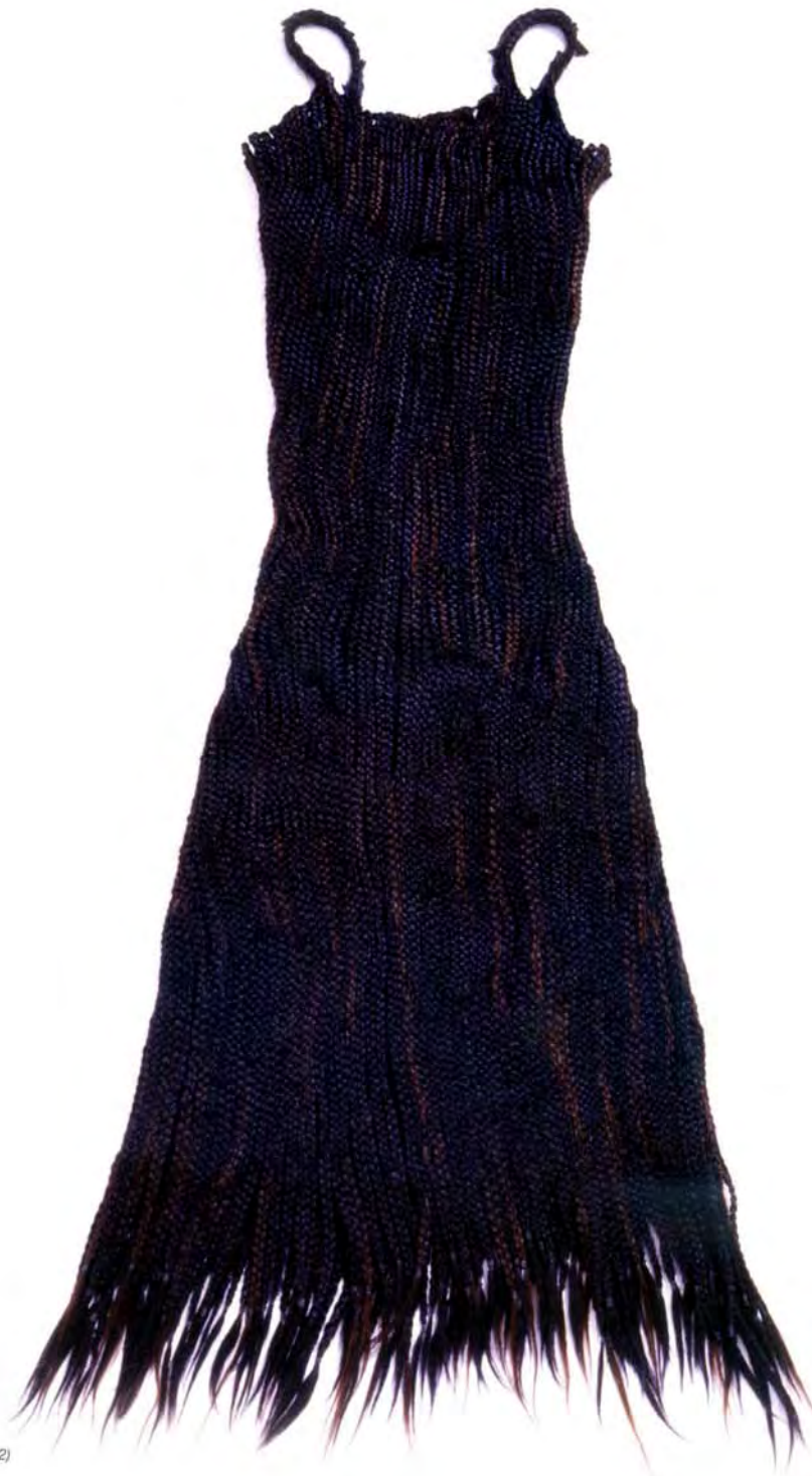
Motohiko Odani Double Edged of Thought (Dress 02) Human Hair H166 XW70 XD3cm 1997