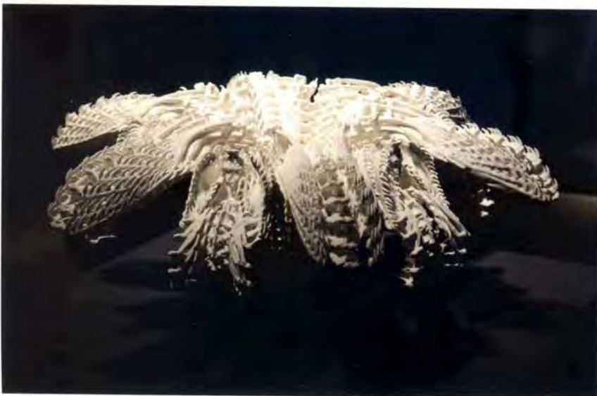
Motohiko Odani SP2 'New Born' Python AB Mixed Media 22 X 43 X 48cm 2007