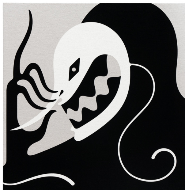
Left: Blinded by the Light , 2022. Acrylic on Canvas. 72 x 72 inches, 182.88 x 182.88 cm Right: Listen You Fuckers , 2022. Acrylic on Canvas. 14 x 14 inches, 35.56 x 35.56 cm

NEW YORK, NY: albertz benda is thrilled to present Cleon Peterson: Mr. Sinister , the artist's first solo show in New York, on view from March 3 to April 2, 2022. In this exhibition, Peterson will premiere a new series of allegorical paintings that investigate mechanisms of power, fantasy, and morality.