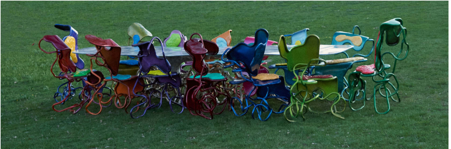
OrtaMiklos, Mother's Ship with 4400 Chairs, 2021.