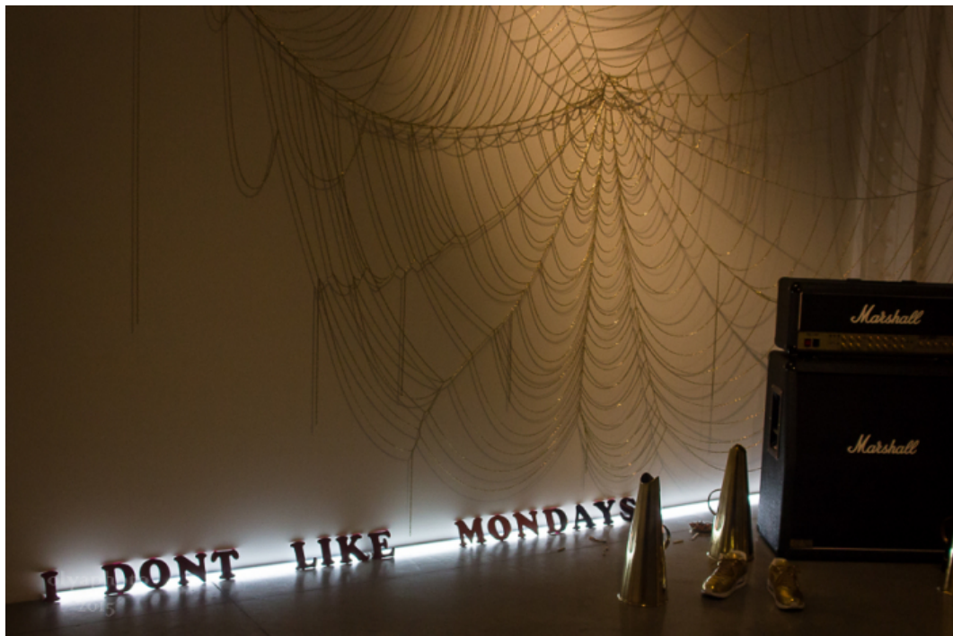
Mondays are blah but Thursday is Art Night