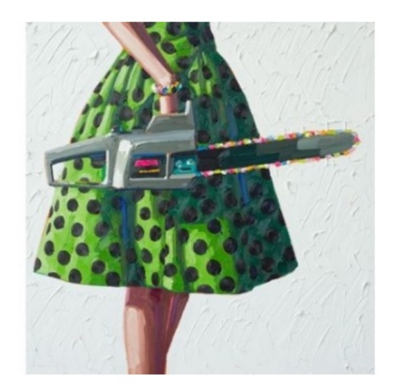
Left: Kelly Reemtsen - On Top / Right: Kelly Reemtsen - Spotted