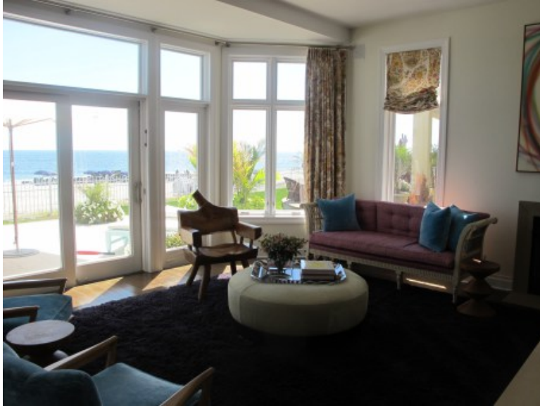
The view from the living room.... the beach.