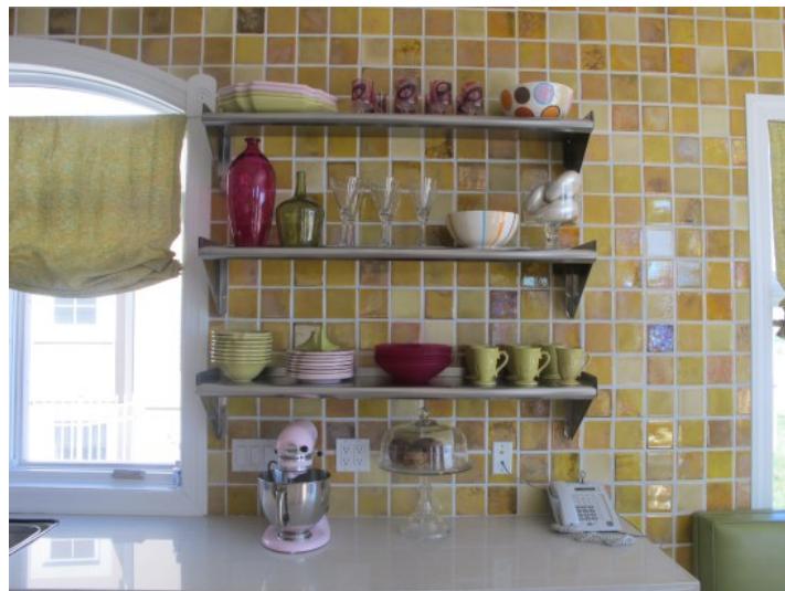
Open shelving. LOVE. (Just fyi, thats how it always looks. We didnt style anything.)

“Summer’s Last Stand: Super Chic Beach House Tour.” Sketch42 , September 7, 2010.