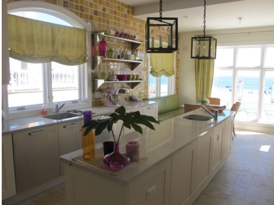
The kitchen. Imagine that... a pretty kitchen that ISNT all white!