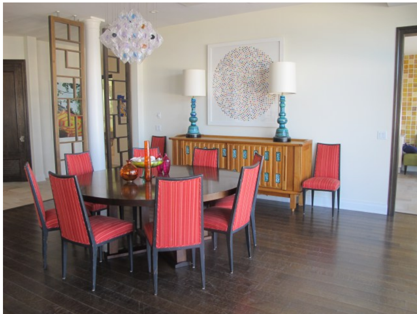
The dining room.

Another little collection... I love how even her pretzels match! I'm so in love with this living room.