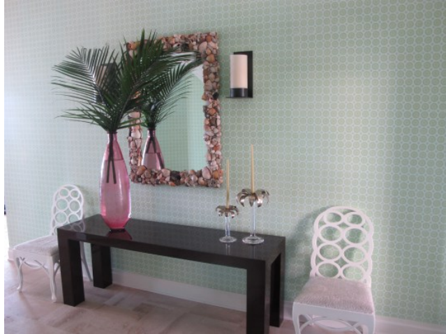
The Foyer. Those leaves were freshly cut out of her garden.