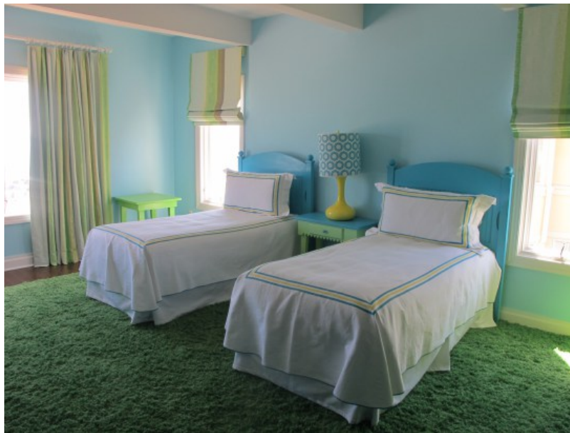
The boys room.

And the cutest, prettiest and coolest nursery ever: