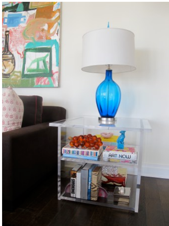
Chic vignette in the living room. She turned me on to vintage lucite grapes. I now need to own them.

“Summer’s Last Stand: Super Chic Beach House Tour.” Sketch42 , September 7, 2010.