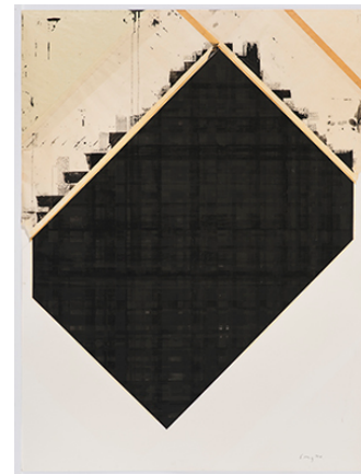
Ed Moses [American, b. 1926] Cubist Drawing # 9 , 1977-78 charcoal, acrylic, India ink, wax paper & masking tape on mat board 55 1/8 x 41 3/8 inches 140 x 105.1 cm (framed) ©Brian Forrest. Courtesy of Albertz Benda and the artist

NEW YORK, NY, November 24, 2015 – For its first showing at UNTITLED. Albertz Benda will present a selection of early work by Bill Beckley and Ed Moses, juxtaposing two artists who played integral roles in the New York City and Los Angeles art movements of the 1970s and have been significant influences on decades of artists to follow. Bill Beckley, a pioneer of Narrative Art, was a staple of the 1970s SoHo art scene, while Ed Moses, experimenting with new processes, emerged in the late 1950s as a leading member of the generation of artists who helped turn Los Angeles into the creative hub it is today. For the booth at UNTITLED., both artists have contributed rare works from their personal archives.