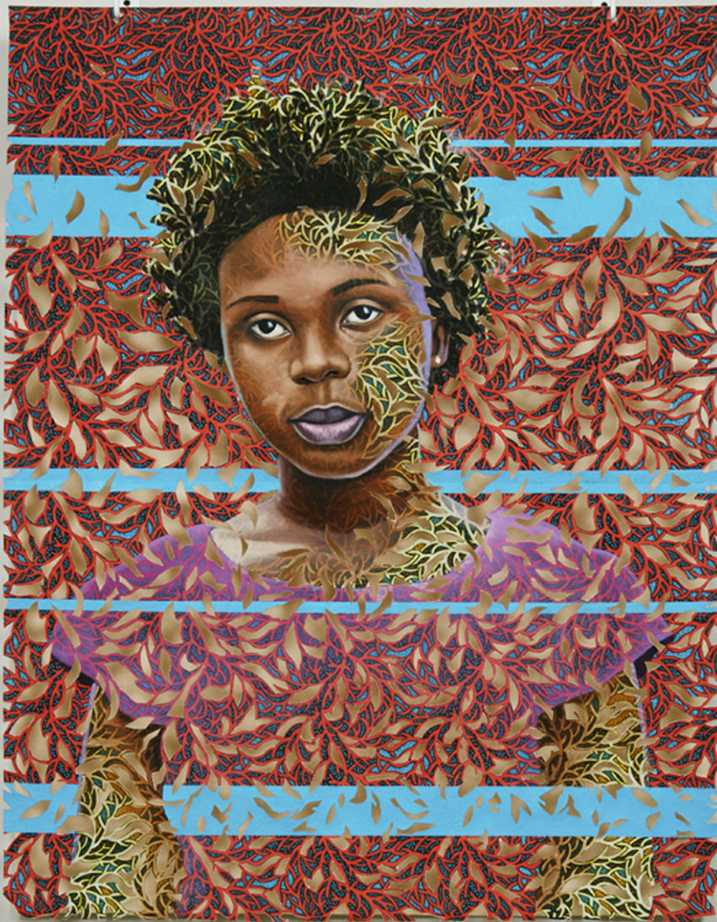
Patrick Quarm, LACED BODY 1 (2020).